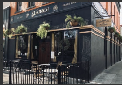
Slainte Pub & Grill