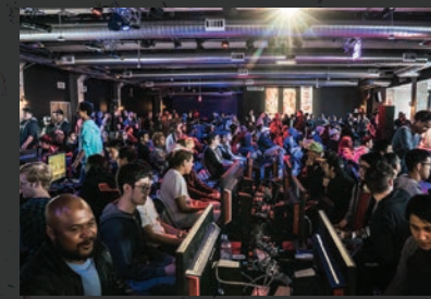
E Sports Arena